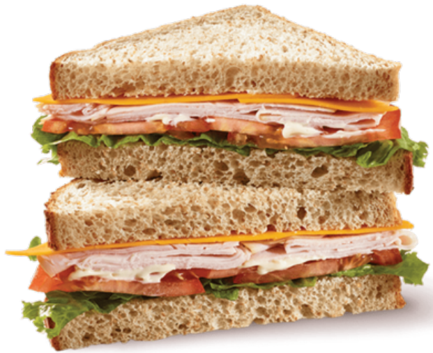
A club sandwich